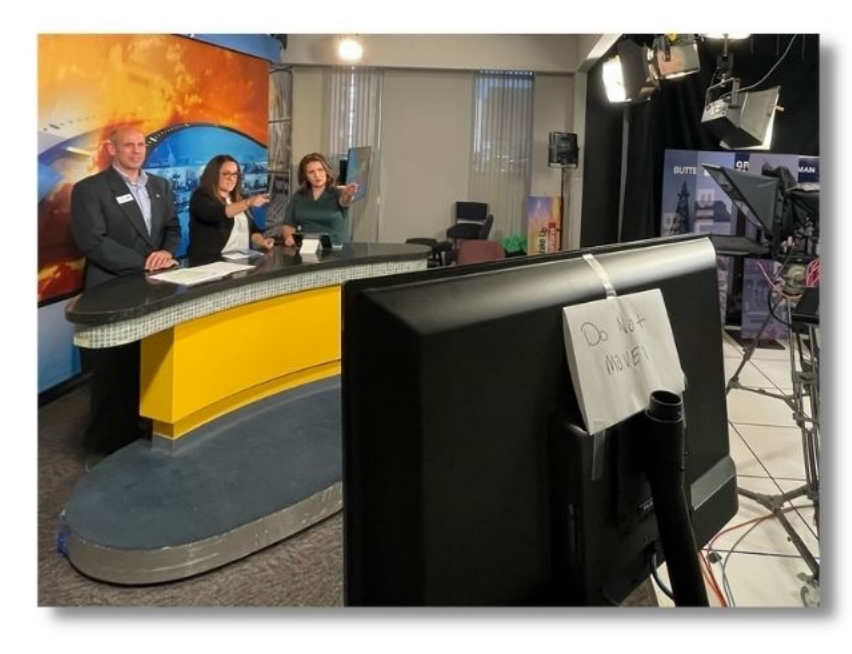
CLICK HERE TO VIEW WORKFORCE WEDNESDAY SEGMENTS